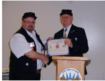
Camp Growth Award: Camp 05