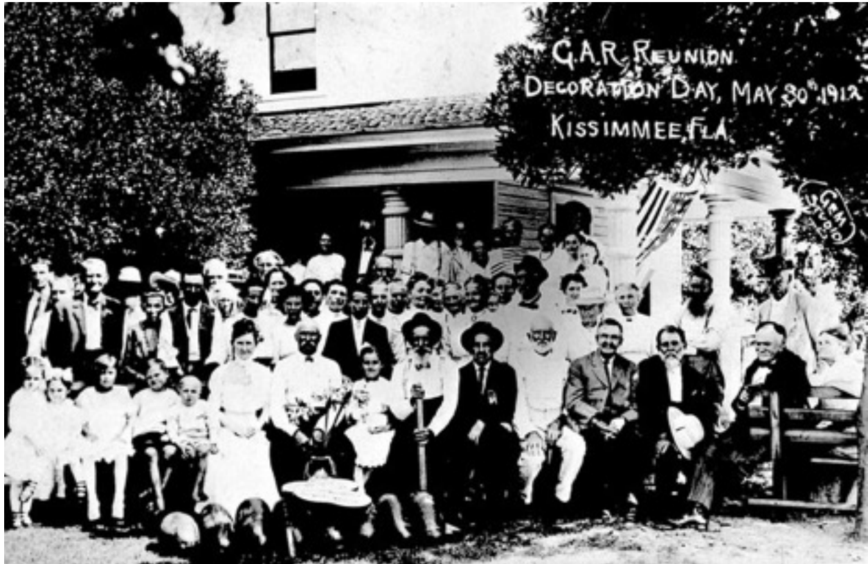
G.A.R. reunion on Decoration Day, May 30, 1912 - Kissimmee, Florida

from State of Florida Library & Archives https://www.floridamemory.com/items/show/142952