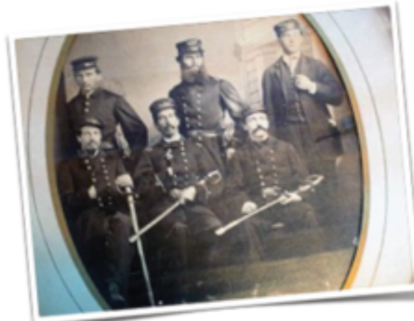
Above, The men of the USS Narcissus, a civil war tugboat used as a Union blockade ship which sunk of coast of Tampa Florida in 1866

Commander-in-Chief Sons of Union Veterans of the Civil War